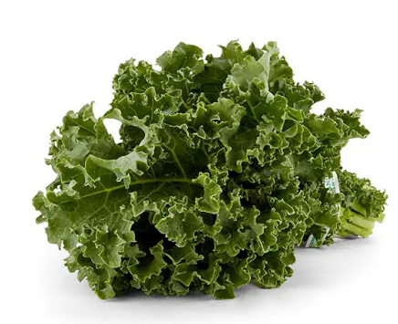
$2.99 <sub>ea</sub> Organic Green Kale Reg price $3.99 USA

2 for $3 Organic Tommy Atkins Magoes Reg price 2 for $4 Ecuador